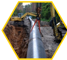
Regulated Pipeline —Steel As-Built