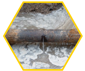
Leak Detection & Repair