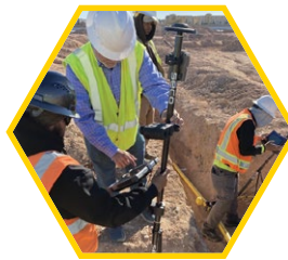
Gas Distribution As-Built