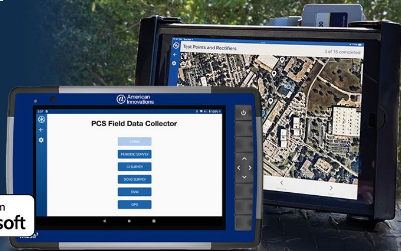
MESA FIELD DATA COLLECTION TABLET