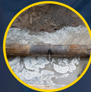
Leak Detection & Repair