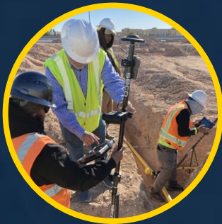
Gas Distribution As-Built