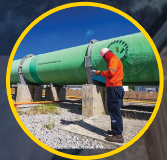
Pipeline Inspection, Repair & Maintenance

CartoPac sets the standard for linear asset traceability and management, combining rules-based mobile forms, high-accuracy GNSS positioning, and configurable back-office review and approval.