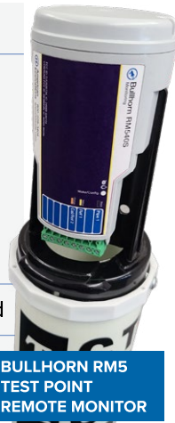
BULLHORN RM5 TEST POINT REMOTE MONITOR

Easy management and configuration via Bullhorn Web