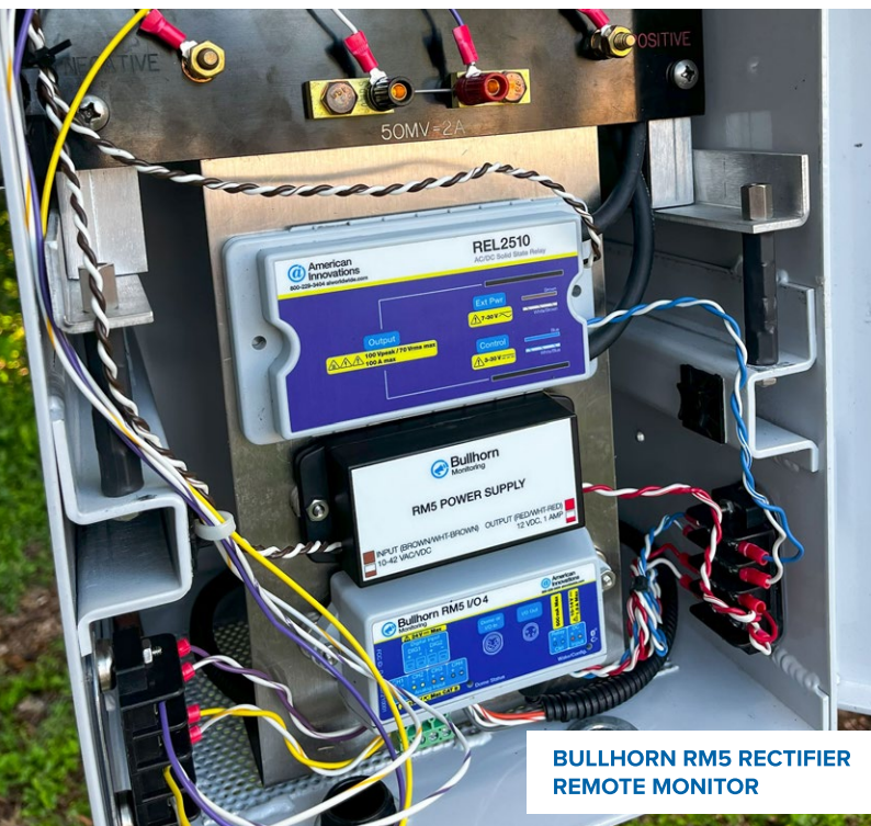
BULLHORN RM5 RECTIFIER REMOTE MONITOR

Industry-leading surge protection and an unrivaled warranty make Bullhorn remote monitoring units the proven choice in remote monitoring.