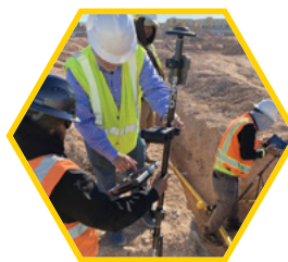
Gas Distribution As-Built