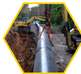
Regulated Pipeline —Steel As-Built