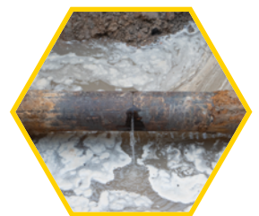
Leak Detection & Repair