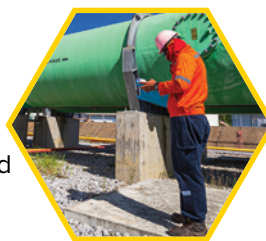
Inspection, Repair & Maintenance